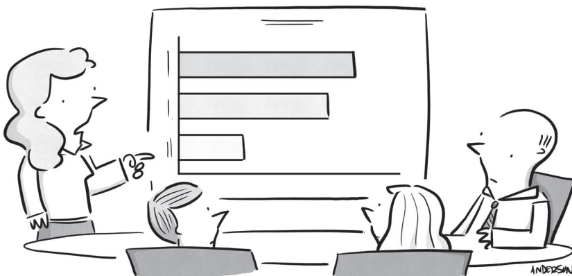
"Serendipity is up, fluke is doing well, but I'm a little concerned about our dumb luck."